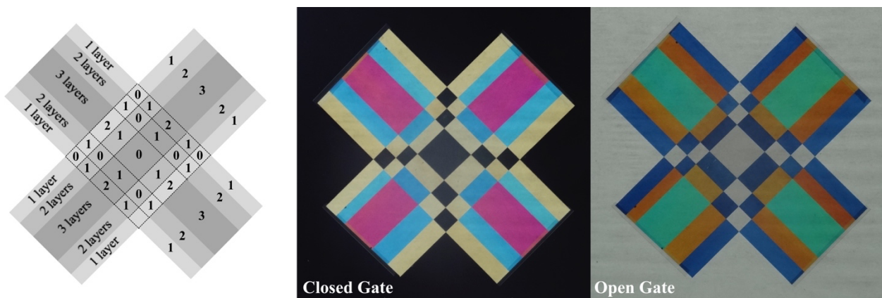
Fig. 3. Clear birefringent gift-basket wrap layered and viewed between two polarizers. This six-layer arrangement provides a demonstration of additive and subtractive birefringence, wherein layers oriented in parallel add and layers oriented at 90 subtract. The Closed Gate arrangement (middle panel) is placed between crossed-polarizers. In the Open Gate arrangement, the two polarizers are aligned with parallel polarizations.